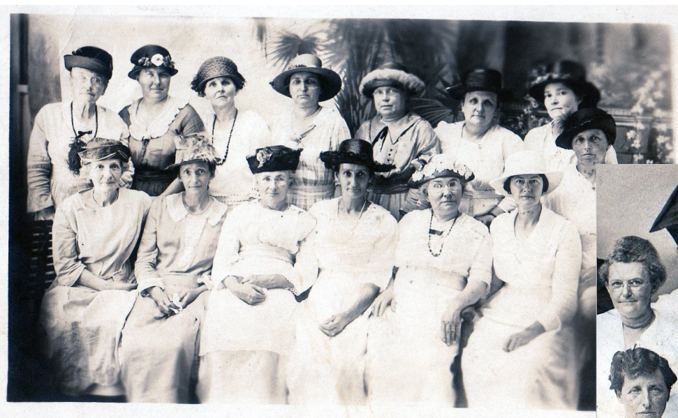
The Richwood Sewing Circle in their finery, 1917

Ewan. Special Easter services were held in the Ewan M.E. Church on Sunday, when the spring suits and hats made their appearance. The hats the ladies of our village chose are a compromise between the over turned dish pan and inverted bushel basket style, and the Merry Widow of last year, but not quite as ridiculous as either. We fail to see the beauty in the new styles of hats and wonder how our sensible sisters can bear to attract so much attention by wearing them.