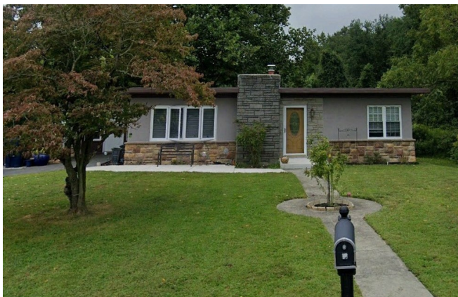
The Elmer & Bertha Maust House in Ewan is a classic example of mid-century residential architecture. Its Bauhaus-inspired design is unique in the township.