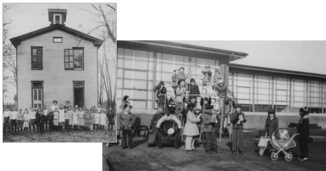
Richwood Academy, 1908, and Harrison Township School, c.1950 All the township's 19th and early 20th century schoolhouses closed when Harrison Township School opened in 1950. Richwood Academy, built in 1870, was the oldest building still in use and housed kindergarten classes. In contrast, the new school was a state-of-the-art facility. The new kindergarten room featured indoor and outdoor play areas and indoor plumbing, a far cry from the Academy. The students didn't just move into a new building; they left the 19th century behind.

We invite you to come and celebrate the exhibition's opening with light refreshments on Sunday, March 26, 1-4 pm, as we journey "back to the Fifties."